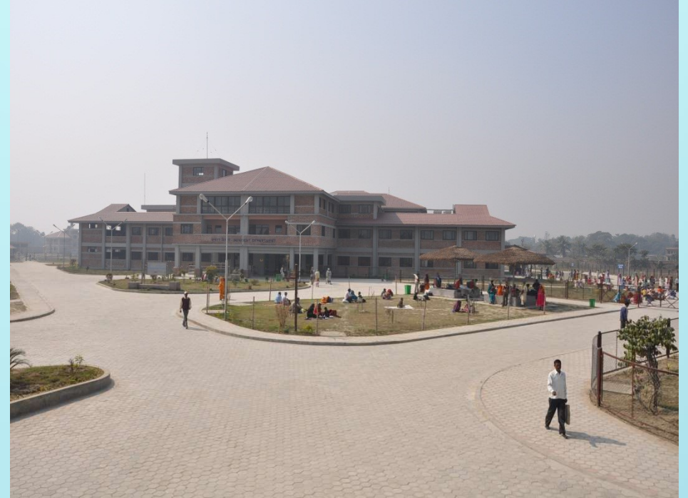
Biratnagar Eye Hospital, Biratnagar