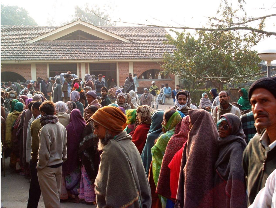
Sagarmatha Choudhary Eye Hospital, Lahan